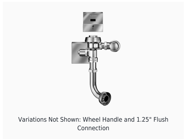
Variations Not Shown: Wheel Handle and 1.25" Flush Connection